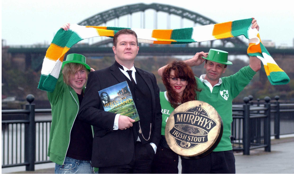
Students and staff at the Sunderland conference.